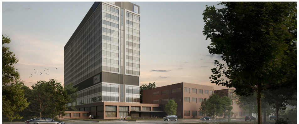
Conceptual rendering of the new Birchmount Hospital.

equitable care. With your generosity and ongoing support, together we can create better futures for the community we serve.