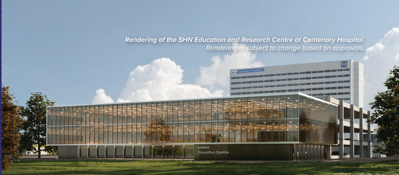
Rendering of the SHN Education and Research Centre at Centenary Hospital. Rendering is subject to change based on approvals.