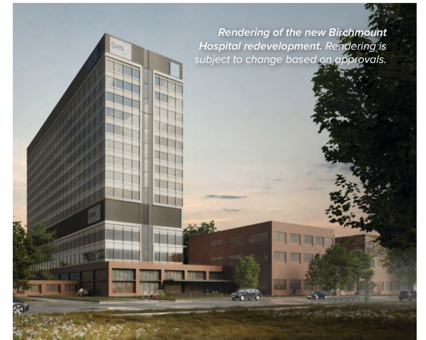
Rendering of the new Birchmount Hospital redevelopment. Rendering is subject to change based on approvals.

A real game-changer for the people of Scarborough, the new Birchmount Hospital will be the largest redevelopment in SHN’s history. We’re building it with love to create a healthy future for the community we call home, for generations to come. Once complete, Birchmount Hospital will nearly double its current capacity.