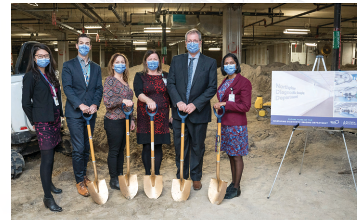
SHN Diagnostic Imaging staff members pose at the Northpine Diagnostic Imaging Department groundbreaking in December 2022.

SHN is also tremendously thankful to Northpine Foundation for their transformational gift to support diagnostic imaging, emergency care, and surgical quality excellence.