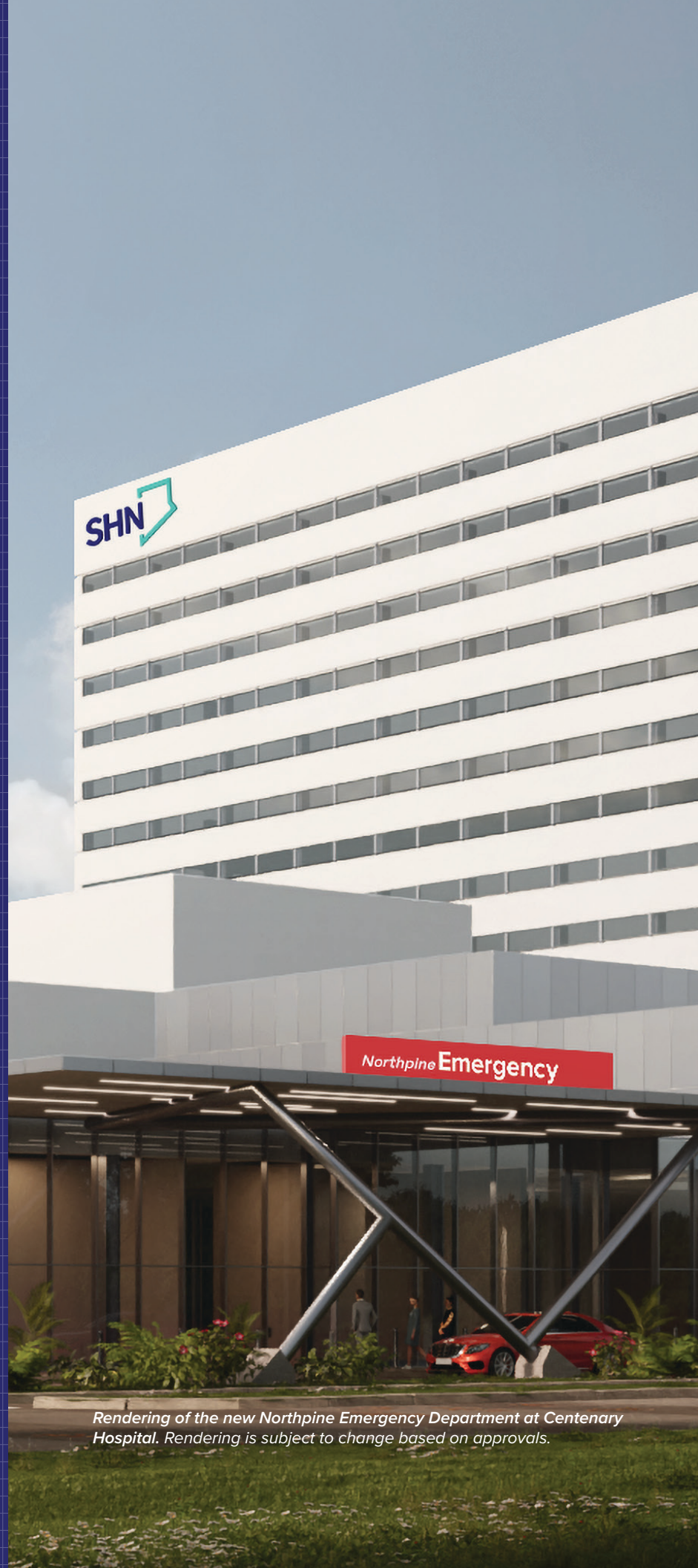
Rendering of the new Northpine Emergency Department at Centenary Hospital. Rendering is subject to change based on approvals.

*Floor plan shown used as a graphical asset only. It is subject to change based on approvals and may not necessarily reflect the final design.