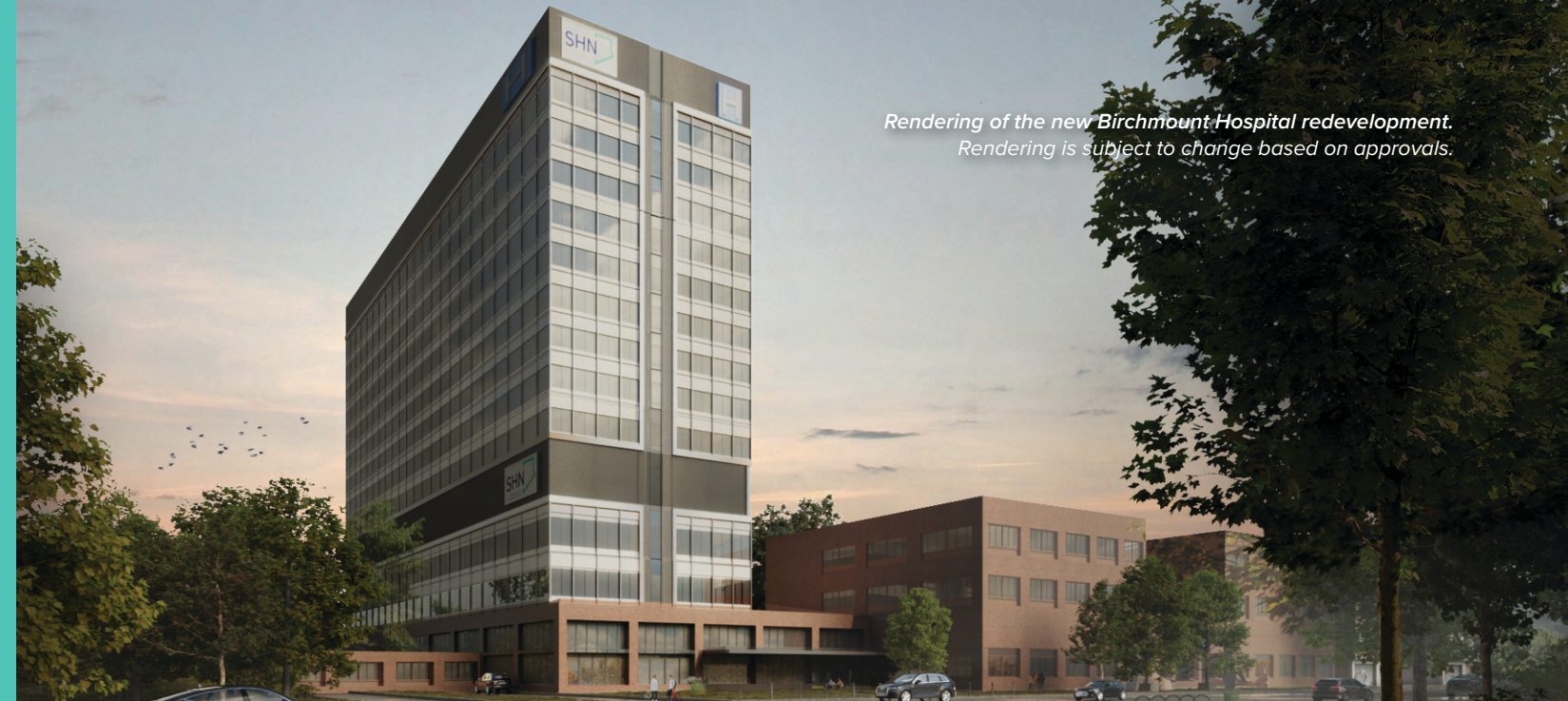
Rendering of the new Birchmount Hospital redevelopment. Rendering is subject to change based on approvals.