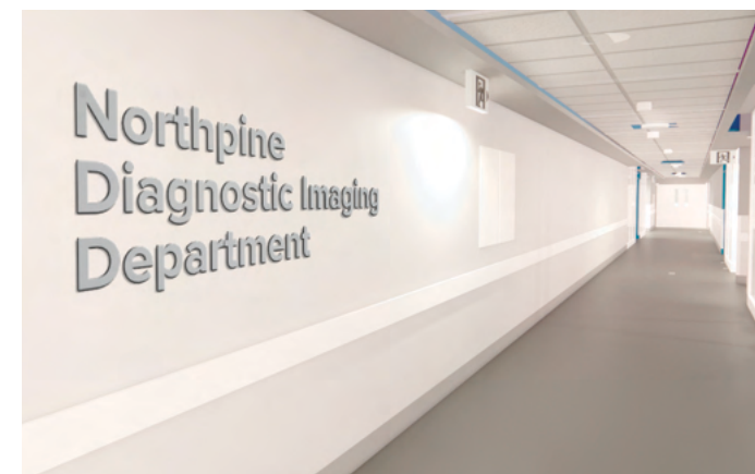
Rendering of the new Northpine Diagnostic Imaging Department. Rendering is subject to change based on approvals.